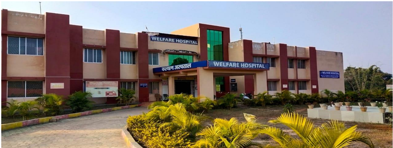
TRIBAL WELFARE HOSPITAL TIGRA, RANCHI

Two Hospital being operated by TRY which is situated at Tigra, Ranchi and Gando, Dumka.