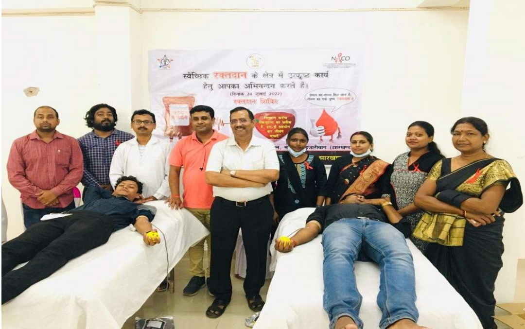
Blood Donation Camp in Hazaribagh