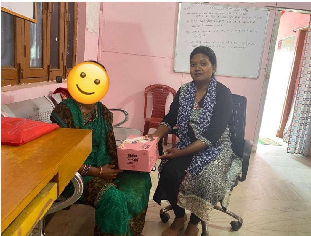
Condom Distribution by our ORW to HRG, s