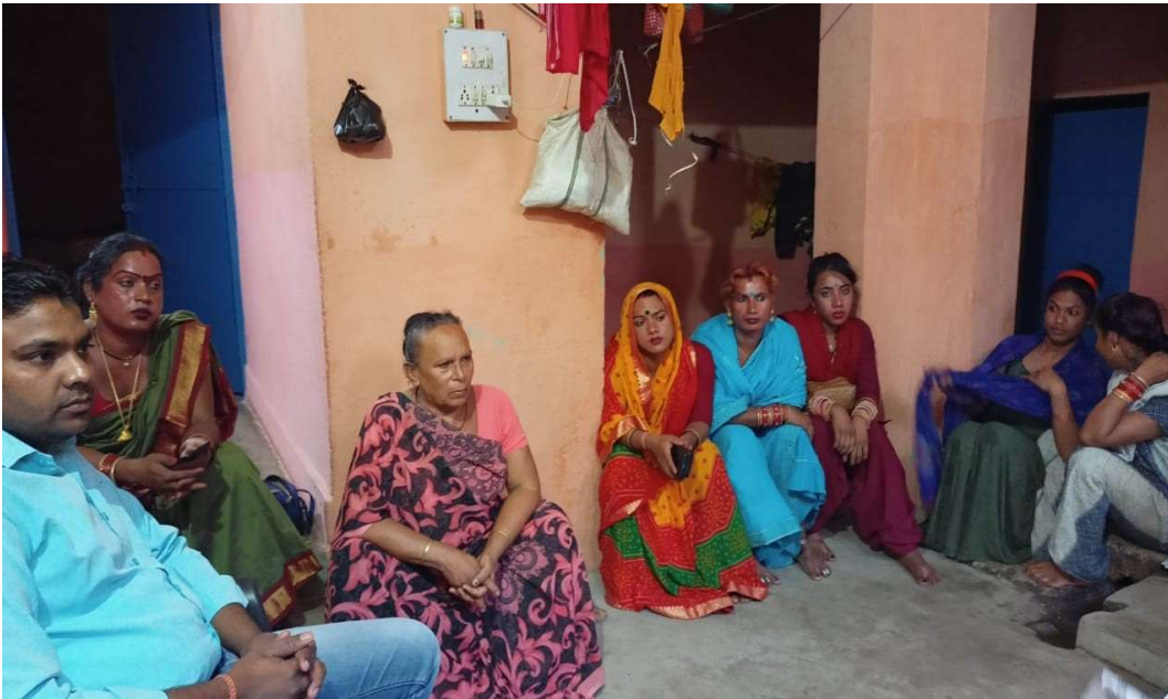
Interaction with TG by our ORW regarding Testing