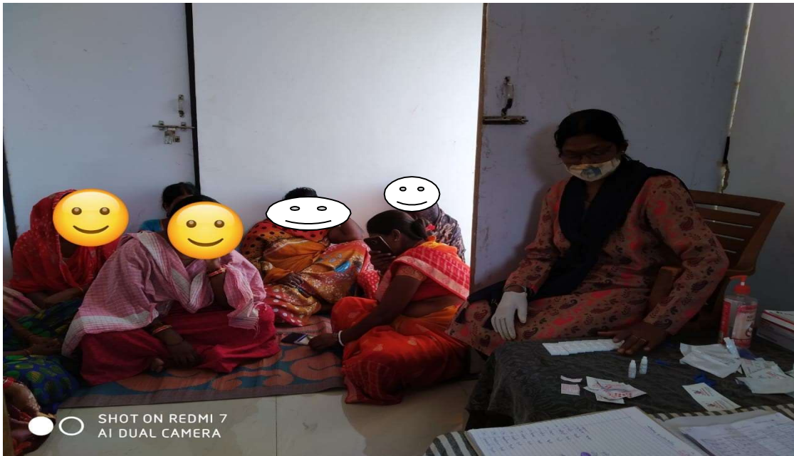
CBS Testing by our ORW of HRG,s