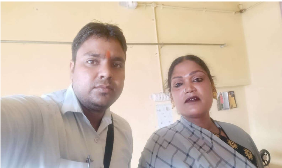
Met to TG by our ORW