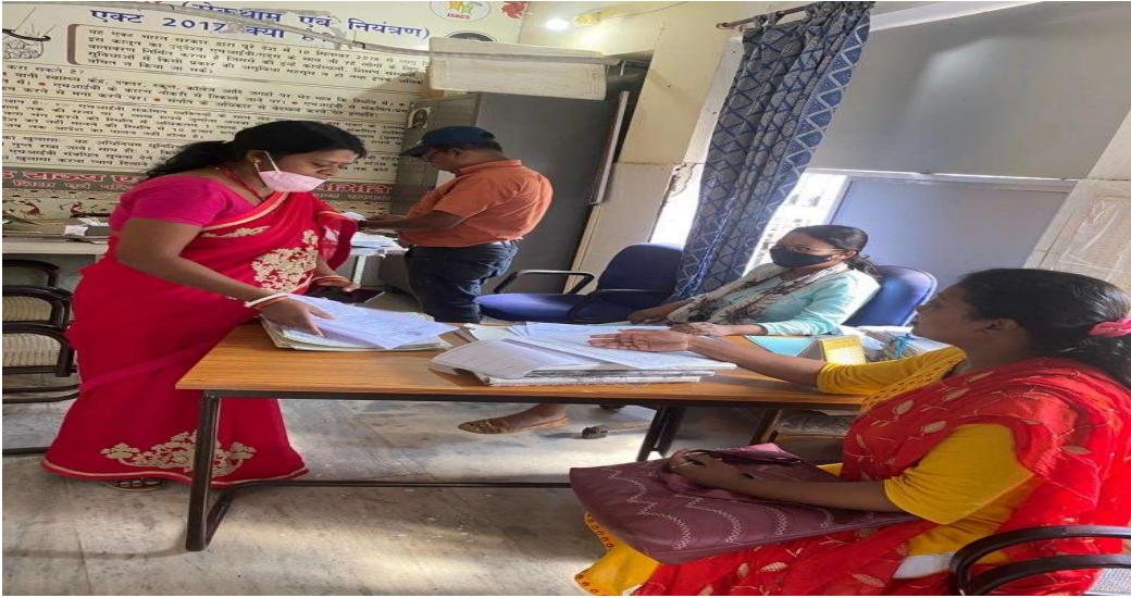
Taking Report by ORW in ICTC